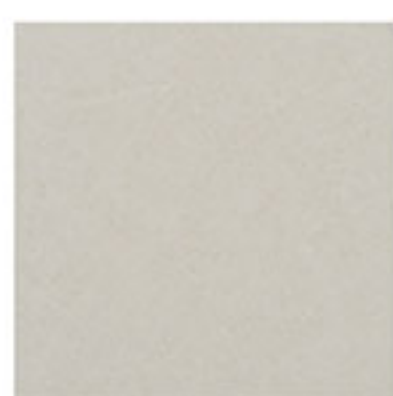
Crema d'Orcia Select